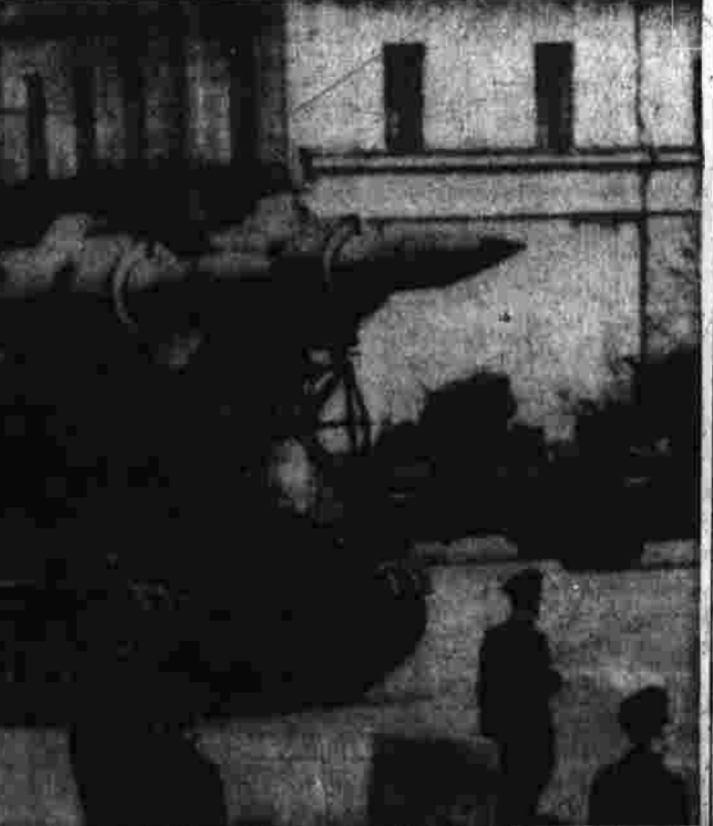
These twin rockets, displayed in Moscow's May Day Parade in Red Square on a self-propelled tracked vehicle, appeared to observers to be designed for field defense against medium and low-flying aircraft. The rockets, about 20 feet long, have a short and narrow leading section and a massive power unit with added clusters of booster rockets for quick starting.